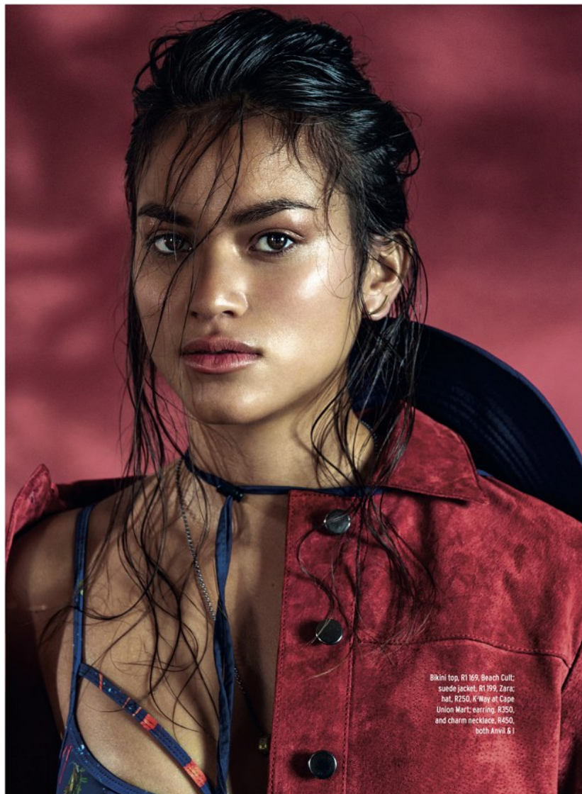
Bikini top, R1 169, Beach Cult; suede jacket, R1 199, Zara; hat, R250, K'Way of Cape Union Mart; earring, R350, and charm necklace, R450, both Anvil & I